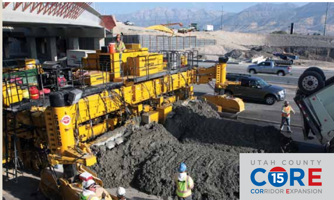
Interstate 15 between Lehi and Spanish Fork in Utah County.

The Utah Department of Transportation recently celebrated the halfway point in construction, and the project remains on track to be complete in December 2012. ■