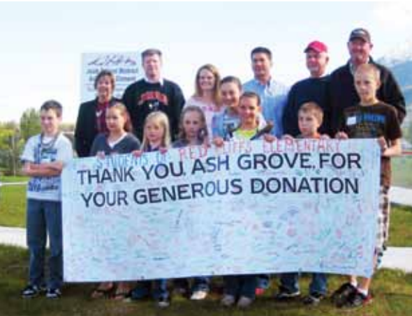
The Sunderland Foundation donated money for a School/Community Fitness Path at the Red Cliffs Elementary School in Nephi, Utah.