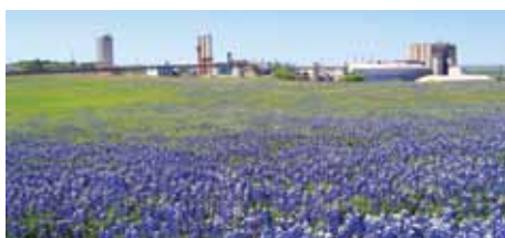
Bluebonnets bloom around the Midlothian plant every April. The bluebonnet is the Texas state flower.